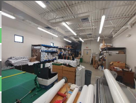
Building Plan View 1351 Aucutt Rd. Montgomery, IL.