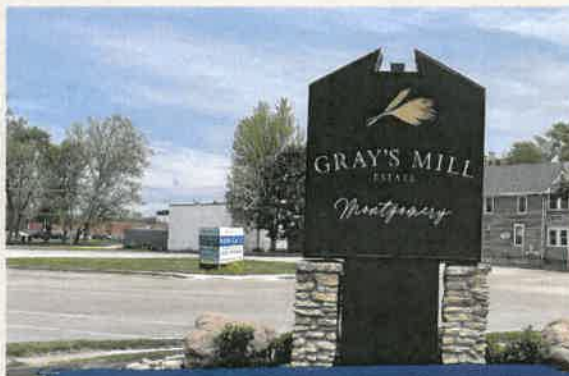
VIEW FROM SOUTH EAST

The property is zoned for Mixed-Use Business and Residential.