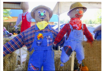
Other Fall Activities

**A $5.00 donation per person is appreciated (includes food, games, and entertainment).