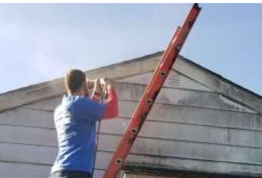
Ultium Cells team member getting preparing to paint.