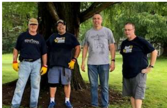
Staff members of Kent State of Trumbull completed extensive yard work for a veteran in Cortland.