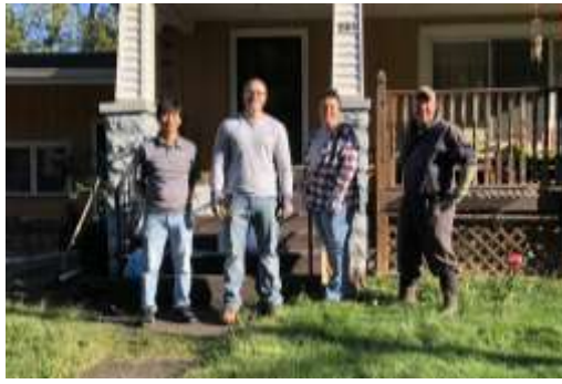
Ultium Cells Team cleaning up a senior's home in Warren.