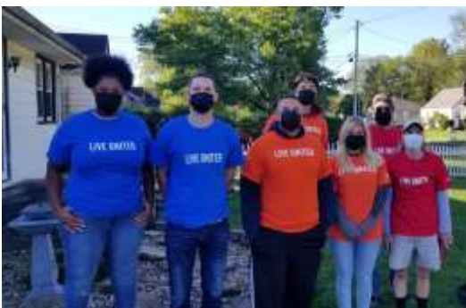
Ultium Cells team preparing to paint exterior home and garage of senior couple on dialysis.