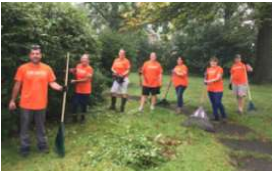
The Mercy Health St. Joseph Warren Hospital Team just getting started.