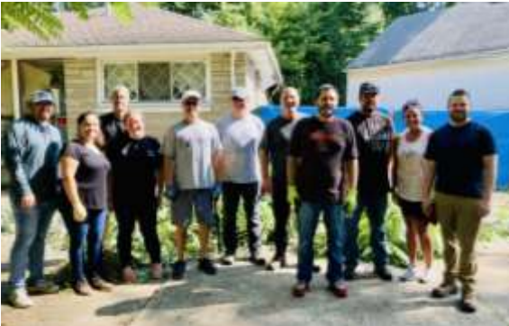
Howmet Aerospace employees completed extensive yard work for a senior in Warren.