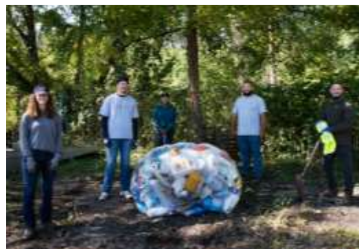
Ultium Cells employees team up to make a difference at Clover Recycling.