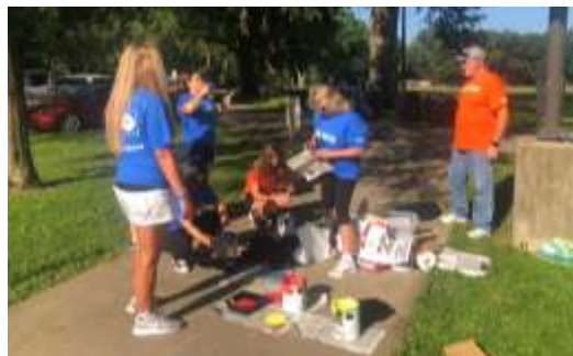
Volunteers from 7 17 Credit Union completed the Born Learning Trail at Perkins Park by painting the corresponding artwork on the ground.