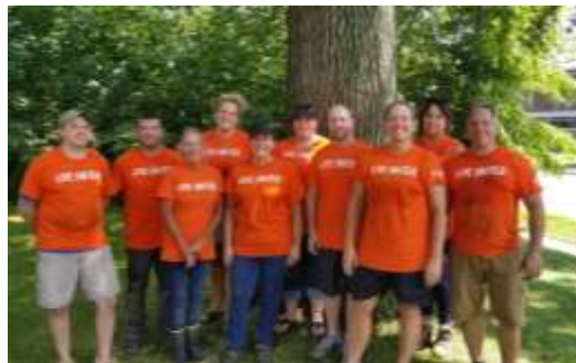
The Mercy Health St. Joseph Warren Hospital team assisted a 95 year old cancer survivor at her home in Niles with extensive yard work and removal of bushes.