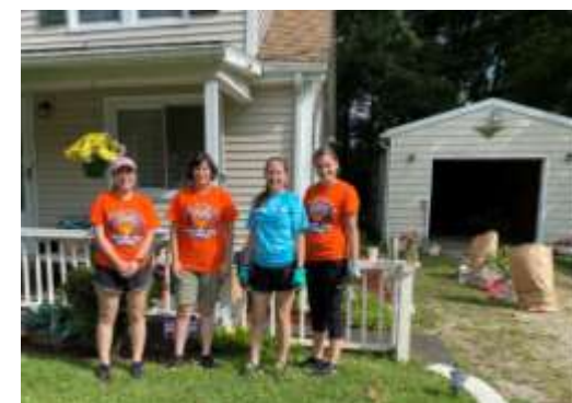
Ladies of Cortland Bank help out a senior in Warren.