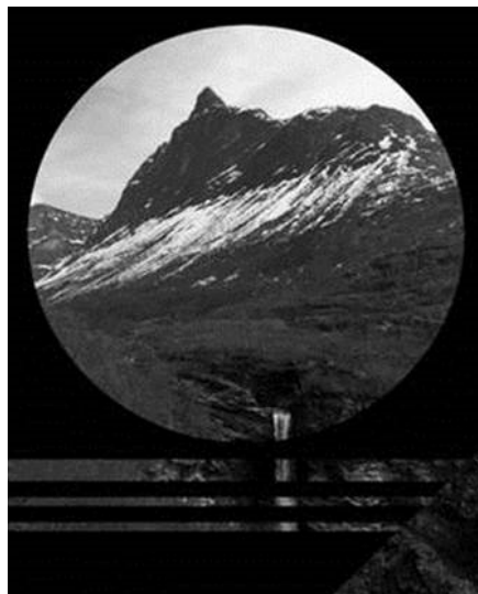
Mark Oliver Not Here Digital Photograph 12" w x 18" h