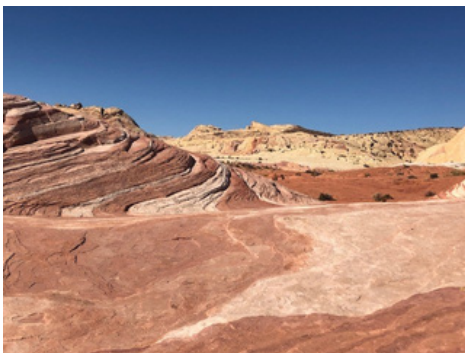
Valley of Fire