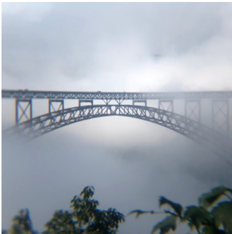
New River Gorge