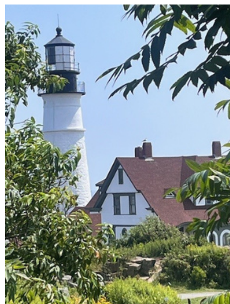
Fort Williams Lighthouse