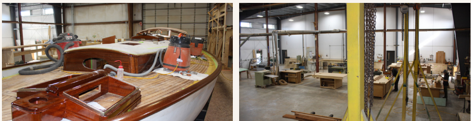
$1 million investment, 7,440 square foot facility, 5 jobs created, and 12 jobs retained— Van Dam Custom Boats business expansion in Boyne City, MI.