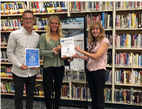
Our 2018 summer interns created the Entrepreneurial Toolkit with over 900 downloads—a simple instructional guide to create a sound business plan with a list of local resources for every step of the startup process. Made possible by DTE Energy Foundation grant.