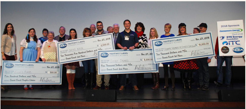
36 entrepreneurs competed, $80K awarded in prize monies for new startups and businesses, 25 businesses launched, and 1,500 people attended our five "Pitch Night" events concluding with, the Grand Event .