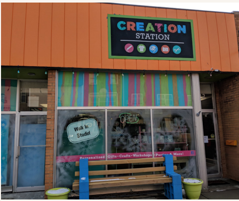
Projected investment of $112,835 for CDBG facade renovation of Creation Station , toy store and make n' take pottery shop in progress in downtown Cheboygan, MI.