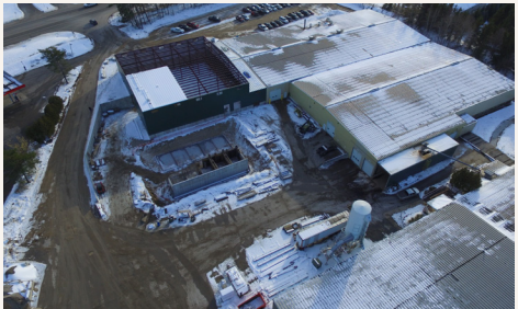
$300k investment, 5 jobs created, and 5 jobs retained by AM Manufacturing —business relocation from Charlevoix to Norwood Township, MI.