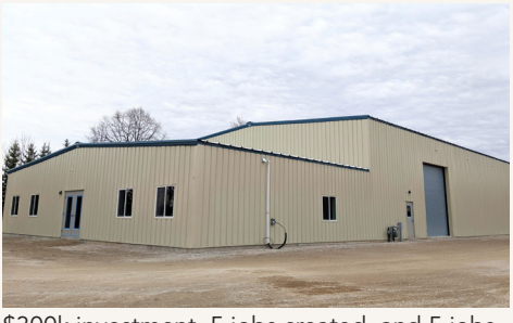
$230 million investment, 10 jobs created, and 28 jobs retained by Votorantim Cimentos St. Marys Cement —plant expansion in Charlevoix, MI.