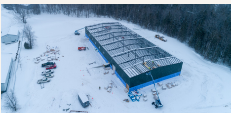
$3.6 million investment, 2,400 square foot rebuild, 10 jobs created, and 20 jobs retained— Lanzen Inc. business relocation Harbor Springs, MI. Retained current operations and workforce in Emmet County.