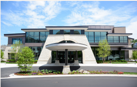
$25 million investment, and 12 jobs created by world-class facility, Great Lakes Center for the Arts —new business in Bay Harbor, MI.