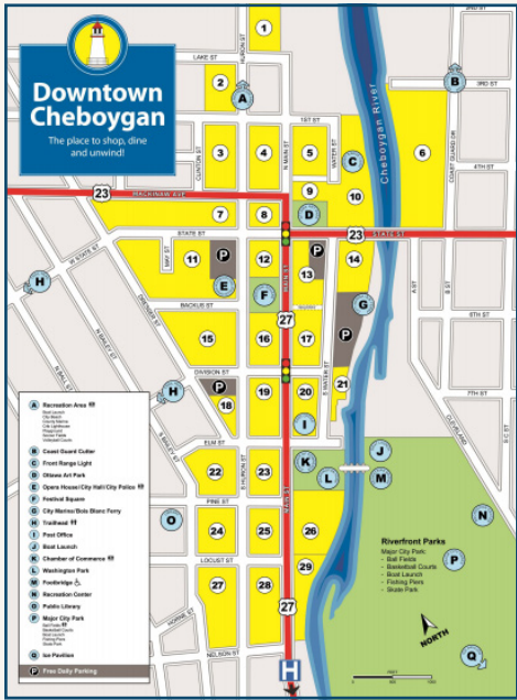
Commercial Rehabilitation and Redevelopment District in place - City of Cheboygan Downtown Development Authority . The city can now provide incentives for commercial property owners to make improvements to their businesses. Property owners can apply for a tax abatement to either freeze the current taxes up to 10 years or abate 50% of the taxes up to 12 years, depending which they qualify for.