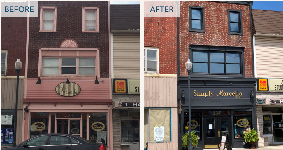
$546,307 investment in 1,300 square foot interior remodel of Simply Marcella boutique and addition of The Queens Head wine pub. Two major CDBG facade renovations finished in downtown Cheboygan, MI.