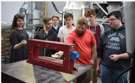
19 local manufacturing companies brought over 500 (8th-12th grade) students from 10 area high schools through their facilities educating students on skilled-trades career paths for National Manufacturing Day .