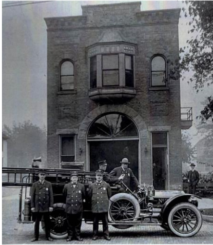
Northside Fire Station 1896-1962

Tallent Hall, 900 Wood Road/Box 2000, Kenosha, WI 53141-2000, Tel. 262-595-2793