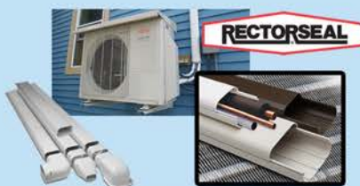
SLIM DUCT, QUICK SLING STANDS, WALL BRACKETS, LINE HIDE

WE ALSO CARRY ALL THE INSTALLATION ACCESSORIES YOU NEED!