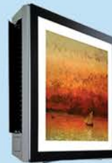
ART COOL GALLERY