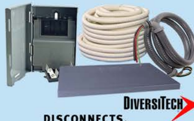
DISCONNECTS, WHIPS, E-LITE PADS, DRAIN HOSE