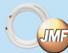
JMF LINE SETS