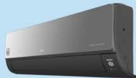
ART COOL MIRROR