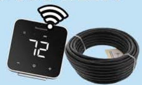
Honeywell D-6 WIFI THERMOSTATS, THERMOSTAT WIRE