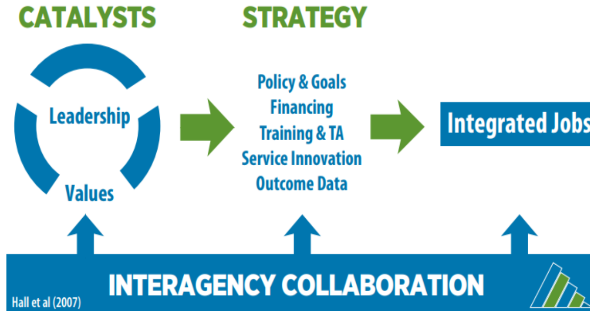
Figure 2. High Performing States