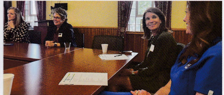
SMILES ALL AROUND AT THE FIRST NWI CONNECTS MEETING IN SEPTEMBER.

A re you a woman business owner looking for leadership, education, and networking opportunities with fellow women business owners? Do you have challenges in your business that are keeping you up at night? If so, let me introduce you to the newest satellite chapter of the National Association of Women Business Owners (NAWBO): the NWI Connects Group.