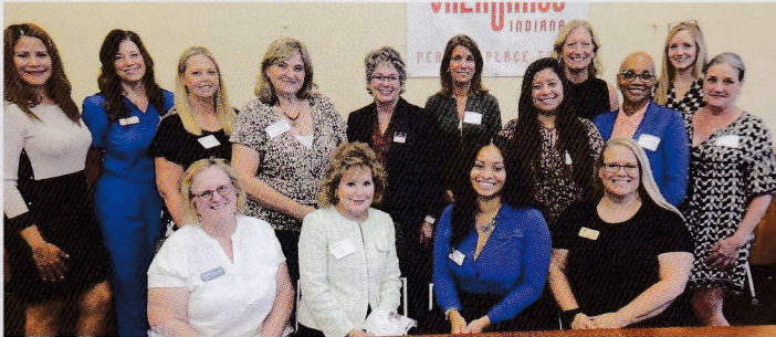
THE WOMEN WHO ATTENDED THE INAUGURAL MEETING OF NWI CONNECTS.

By Cheryl Wooten