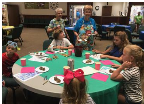
UMW assisting with VBS!

We adjourned to a delicious "take-away" brunch prepared by our UMW Executive Committee . Hope to see you at our next meeting in September.