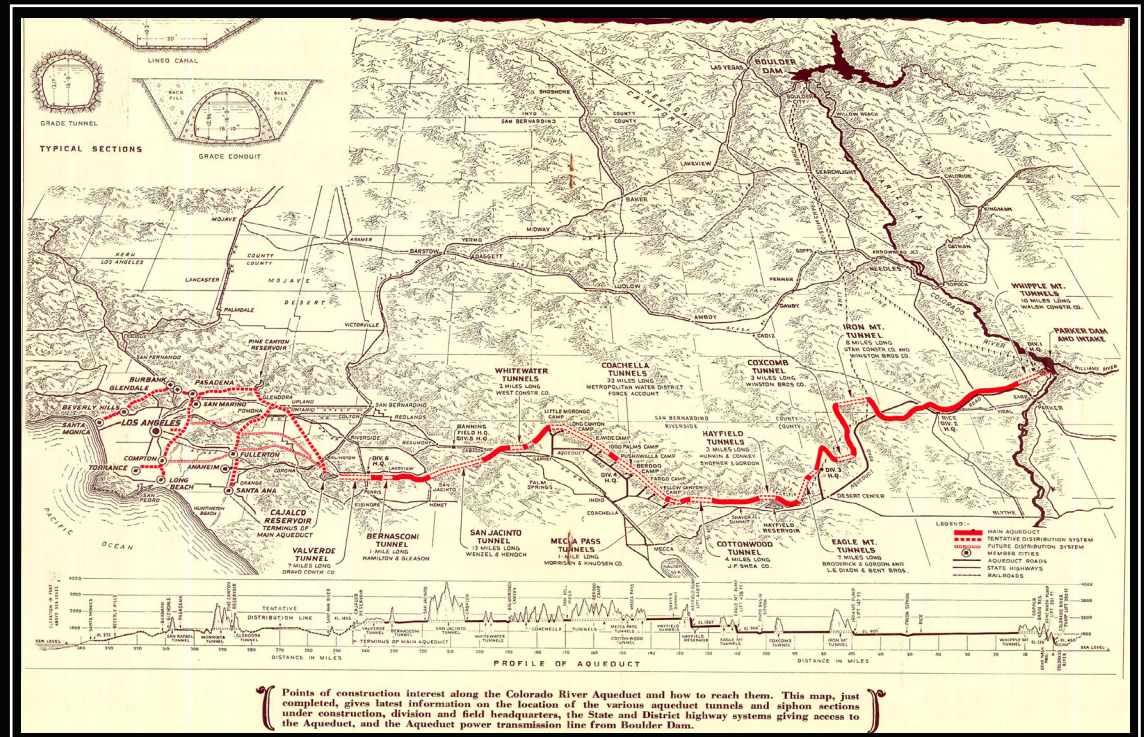
Aqueduct Under Construction Map