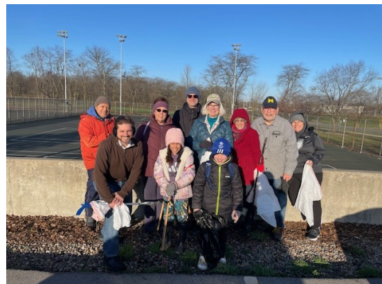
Green Team cleaning up the River Greenway