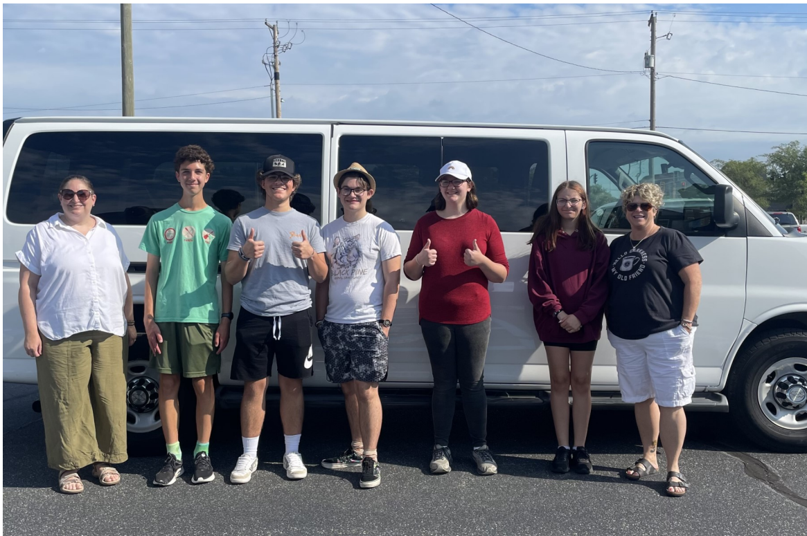
Regional Youth Event trip to Rock Island, IL