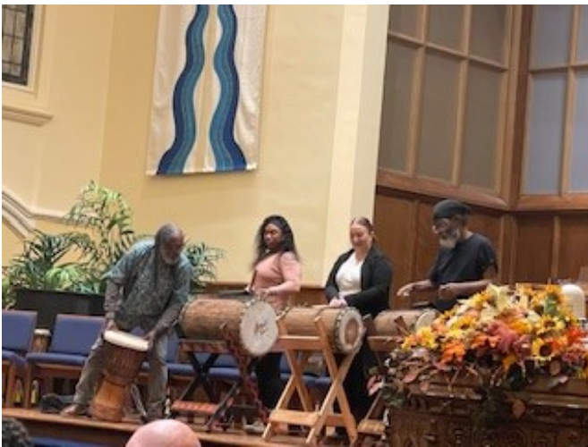
Local drumming group at ICMEP's drumming extravaganza