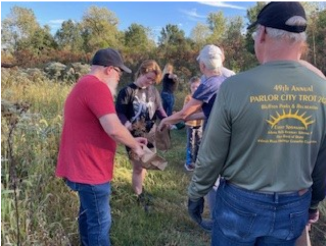
Collecting seeds at Eagle Marsh as part of the Green Team's Fall Fest