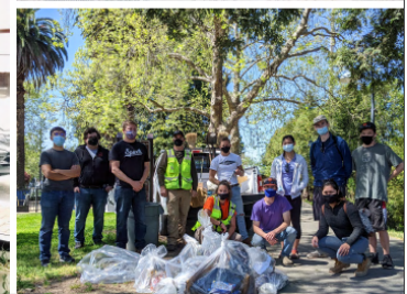
REGION 9 YMFs