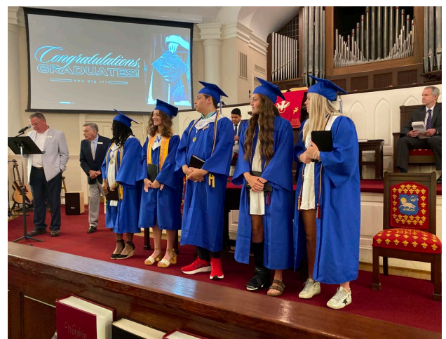
(pictured: our 2024 combined graduation service)