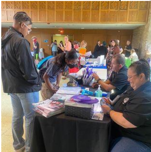
Image description 3: A photo of a large room, with many people in the background. In the foreground there are two people seated behind a table. On the table, there are printed materials and devices. In front of the table there are two young adults. One is standing and appears to be looking at the items on the table, and a second is bending down and touching an item.