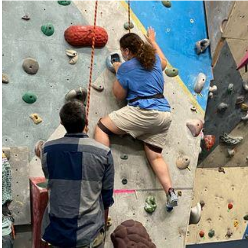
Image description 4: A wall with colorful projections resembling rocks fills the background. A person in the lower half of the picture is holding a rope. That rope appears to move upwards and back down towards a person with a ponytail in a harness. The person in a harness is partway up the rock wall.