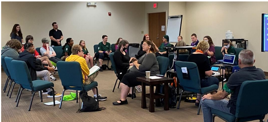
Image description 5: A group of young adults sit in a circle. Sign interpreters are seated in the middle, and throughout. Print is being projected on the wall.