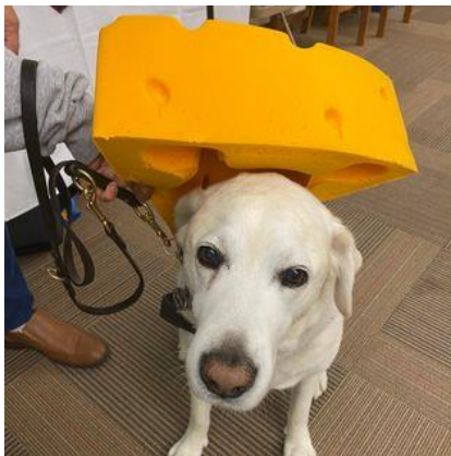
Image description 1: A white dog face with brown nose and dark eyes faces the camera. A hand and a guide harness are visible. The dog is wearing a cheese-head style hat.

Young adults all agreed that the information they learned was useful, and that they learned something they will use at home or school (such as learning about magnifiers, live stream captioning, trying a guide dog, using kitchen tools and gadgets designed for people with visual impairments, learning sign language, working with anxiety, and speaking up for themselves). Parent evaluations noted all parents strongly agreed or agreed that MTI was relevant to their family, and 100% strongly agreed that their young adult will benefit from attending. Parents said they planned to follow up on referral to vocational services, different tips about transition to college, things to help with vision changes, requesting live captioning for classes, accessible pharmacy options, and allowing their child to self-advocate. Soon there will be recorded sessions to view – check the “ What’s New ” section of the Project Reach website for updates. Next year MTI will be at Webster University in St. Louis, MO from July 13 – 17, 2023. If you know a young adult and family who would benefit from attending, please contact Project Reach! Enjoy these candid photos from this year’s MTI!