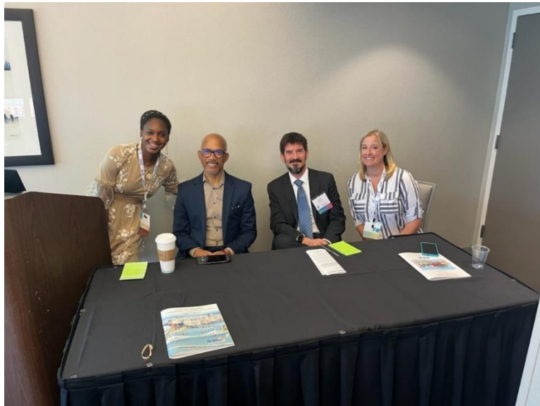
Colleagues from The Century Foundation presenting at the National Council for Workforce Education Conference in Portland, Oregon. A partnership with the Urban Manufacturing Alliance is researching inclusive workforce development practices at 12 community colleges across the nation, further expanding CSE influence in the sector.