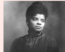
Ida B. Wells