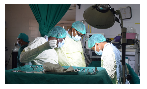
With 1,688 procedures last year, surgery was one of the most in-demand specialties at DCMC.

is in a growth mindset and 2023 was all about remodeling old spaces, opening new buildings, adding specialties, developing partnerships, and more. One thing that remained the same: the health, hope and gratitude of nearly 100,000 patients. Your support is improving health - and saving lives - in Tanzania. Thank you!