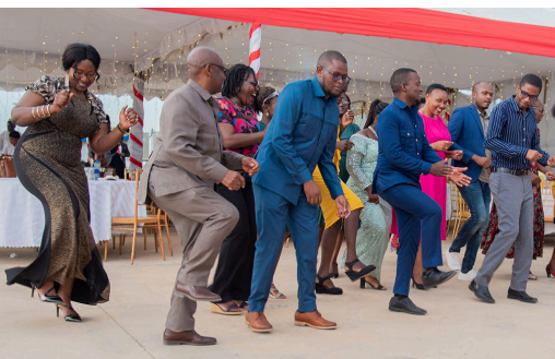
DCMC staff celebrating 20th anniversary.