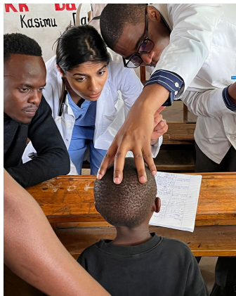
For the first time in their lives, 1500 children and 200 adults in rural villages were screened for eye health. Dozens were referred to DCMC for follow-up care and prescription glasses.