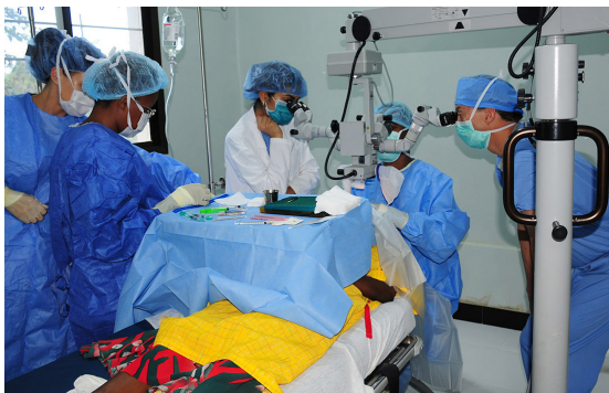
Visiting ophthalmologists performed surgeries and trained local staff.

DCMC's Eye Clinic is the only one-stop shop for total vision care in Central Tanzania