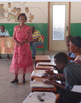
A CHW participates in DCMC's seminar on maternal health in rural Bahi district.

As part of DCMC's commitment to improve maternal and child health in rural Dodoma, DCMC's Community Health Department, in collaboration with the Tanzania Ministry of Health, is leading skills training seminars for Community Health Workers (CHWs). CHWs fill critical gaps in care for pregnant women living in rural areas who have limited access to health facilities and trained professionals.