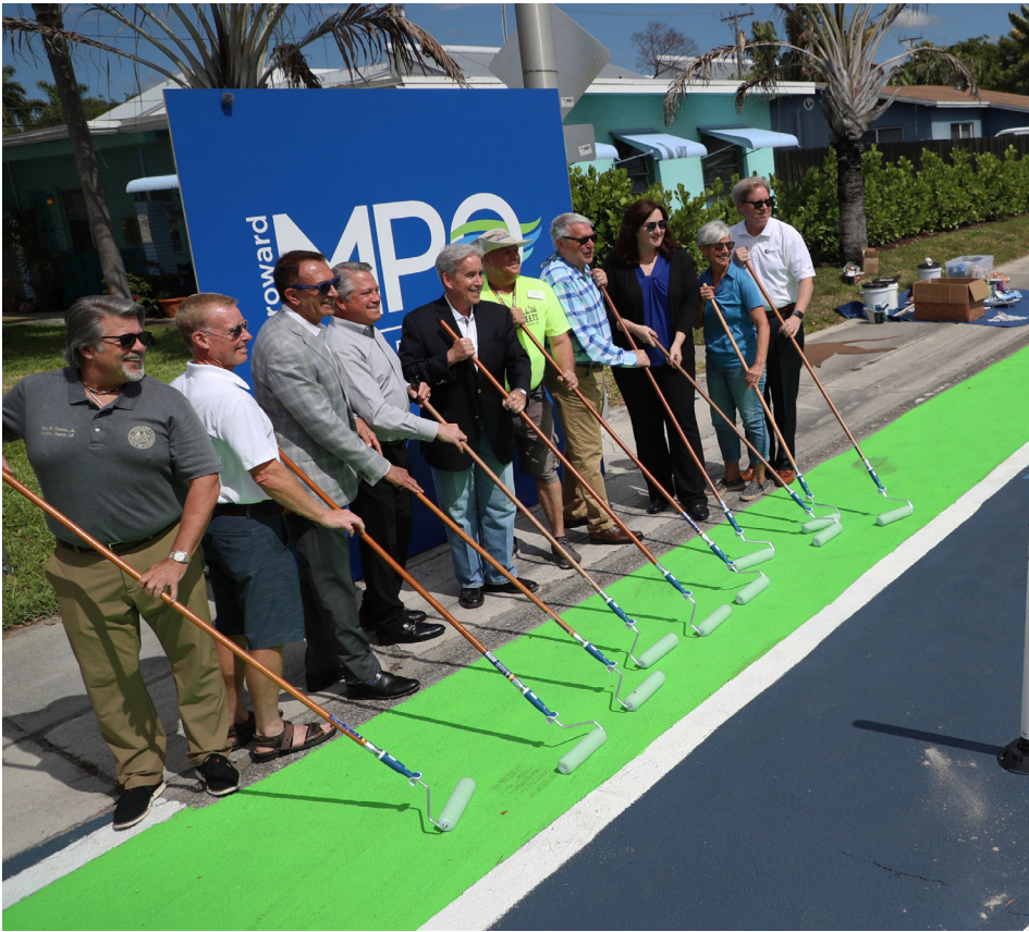
City, county and state officials, and local leaders pose for photos along NE 15th Ave.