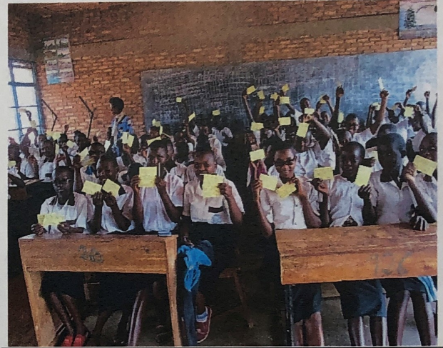
Students from Burundi excited by the UCE message