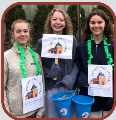
Morse High School teen volunteer at the BIW Gate Collection.