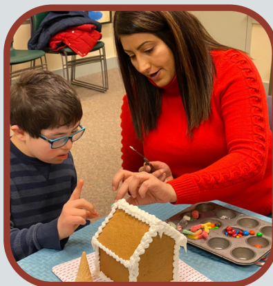
Participants at our Gingerbread House Making event.