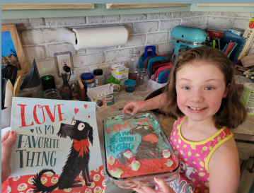
A children's entry in our annual Edible Book Contest