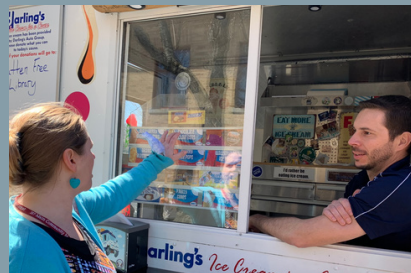
Darling's ice cream raised money for us at our Goat Day event.