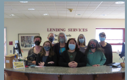
Staff welcomes patrons back into the library after being closed.