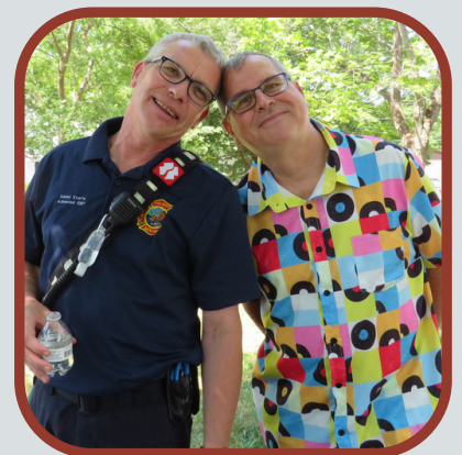
Donors at our Music in the Park donor appreciation picnic.