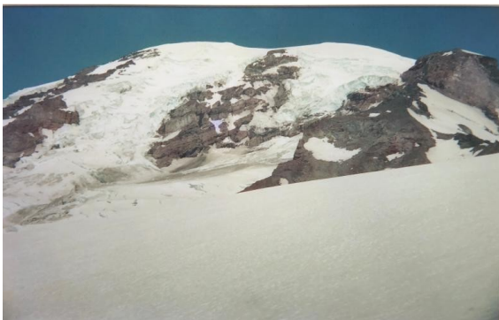
Left Picture: Mount Rainier, WA

In particular note are photos of the World Trade Center in New York City and La Cambe Cemetery in France, where World War II German soldiers are buried.