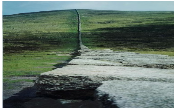
Right Picture: Mourne Mountains, Northern Ireland