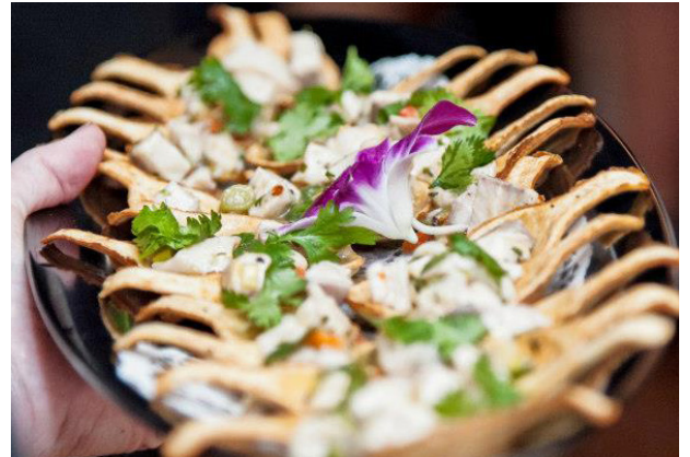
Mini Brie Baked Brie Topped with Raspberry Preserves and Wrapped in a Puff Pastry