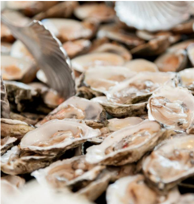
Scallops Wrapped in Bacon served with Cream Horseradish Sauce