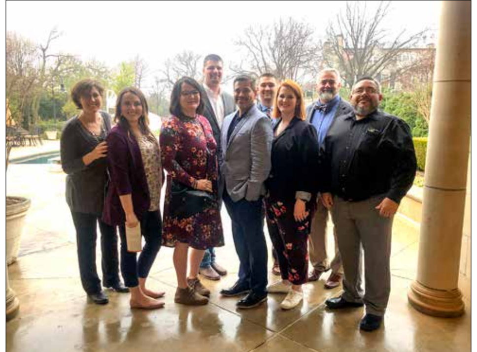
The Leadership Class XXII poses for a class picture outside the Governor's Mansion pool house.