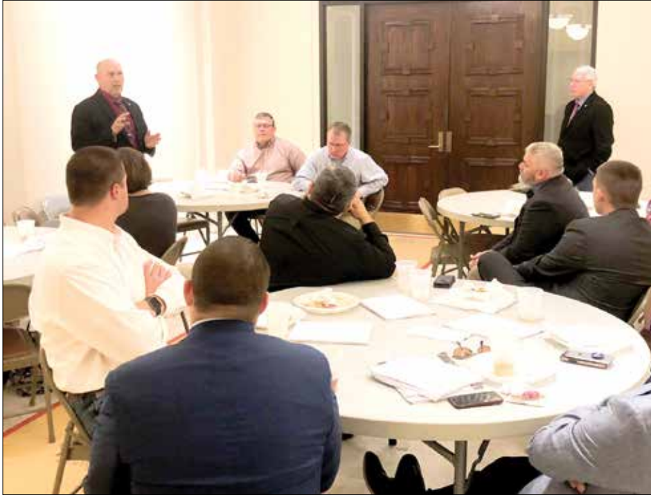
Senator Dewayne Pemberton speaks with the class about the issues facing the State Government right now.