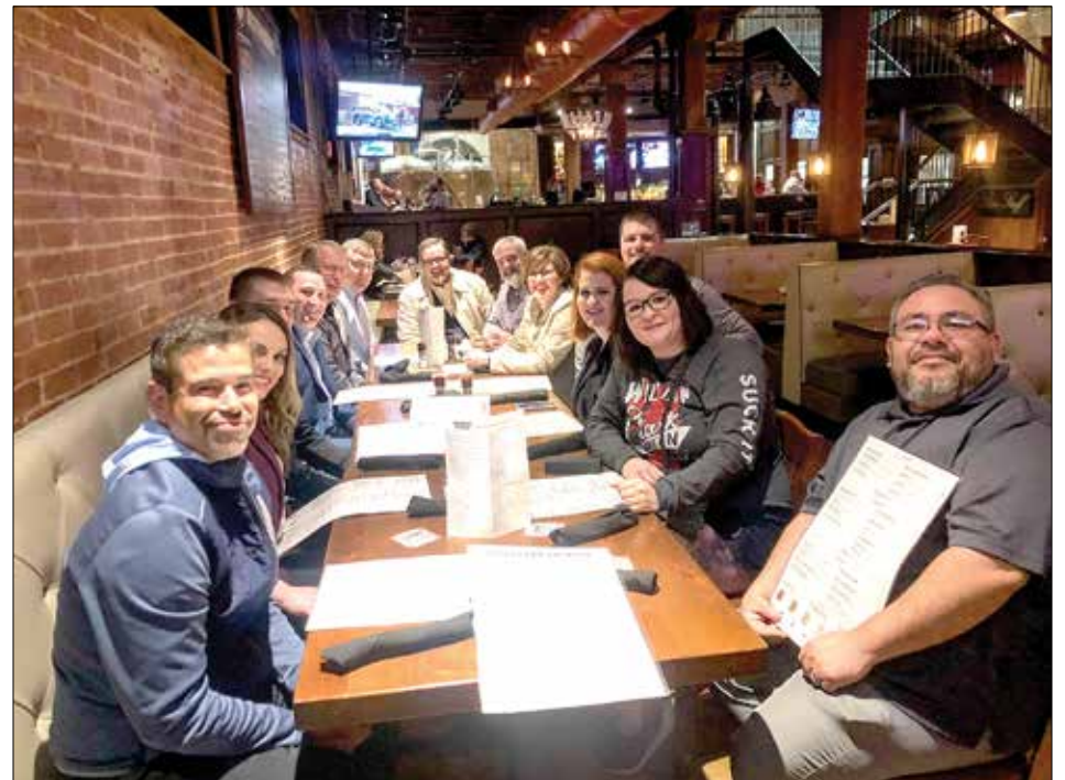
The Leadership Class enjoys dinner at Bricktown Brewery for some downtime during the Oklahoma City Trip.