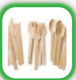
Cutlery labeled "Compostable"