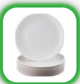
Paper Cups & Plates