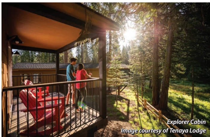
Explorer Cabin

There’s no bad season to visit Yosemite; fall colors, winter snows and spring greenery each have their own magic, and it’s a natural for summer. Just plan ahead in summer to avoid post-Covid, school vacation crowds.