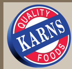
"Others" Award Karns Quality Foods

Local 13-year-old top finalist in the Food Network's Kid's Baking Championship