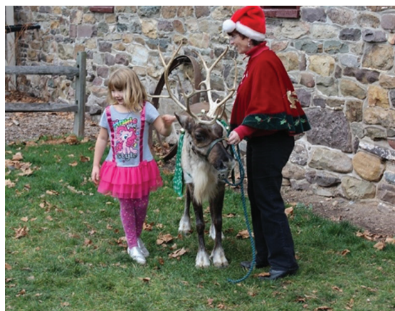
Photo Contest. Winners will be announced Sunday, January 12, 2020 at 1 pm. Prizes will be awarded for winning entries. The People's Choice awards will be announced after the display ends. Prizes go to top votes in each category.