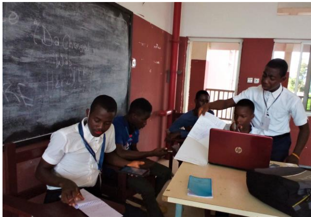
The Ganta UMS debate team spent 2 weeks at MVTC and prepared daily for debates by researching topics.