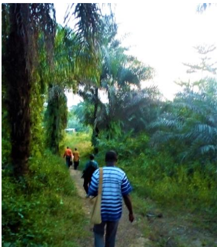
Obelia Scott Ross UMS teachers leave school after a day of training.