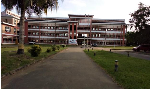
The Youth for Change National Debate Championship was held at the Monrovia Vocational Training Center (MVTC) in Paynesville, Montserrado County.