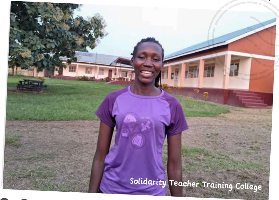
Solidarity Teacher Training College