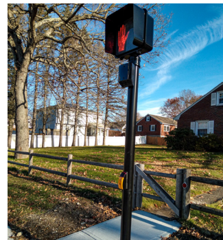
Fisher Street Pedestrian Signal