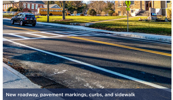
New roadway, pavement markings, curbs, and sidewalk

Route 1A is Walpole's main commercial corridor, as well as one of the region's main thoroughfares. This project was initiated to address deficiencies in the roadway infrastructure. The improvements will address public safety concerns and improve economic development by providing safe and practical access to businesses and supporting future growth through renewed infrastructure.