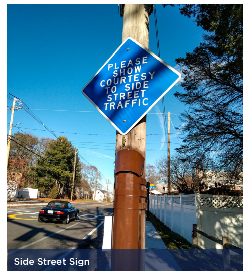
Side Street Sign