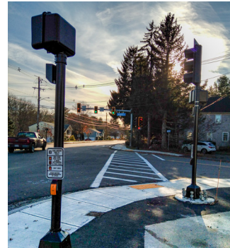
Bullard Street Pedestrian Signal

The refuge island has been installed at the intersection of Main Street and Gould Street. Its purpose is to support pedestrian movement by helping them safely cross the unsignalized intersection. New traffic signals have been activated at the intersection of Bullard Street/ Willett Street and Main Street and at the intersection of Fisher