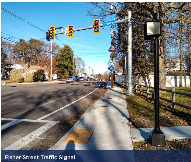
Fisher Street Traffic Signal

Street and Main Street. The existing signal at the Stop & Shop intersection has been upgraded to modern standards.