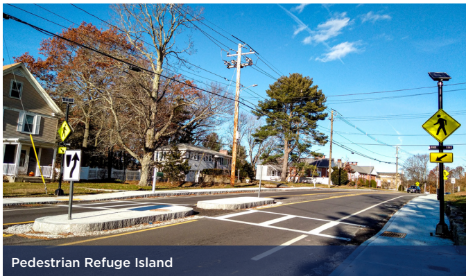
Pedestrian Refuge Island