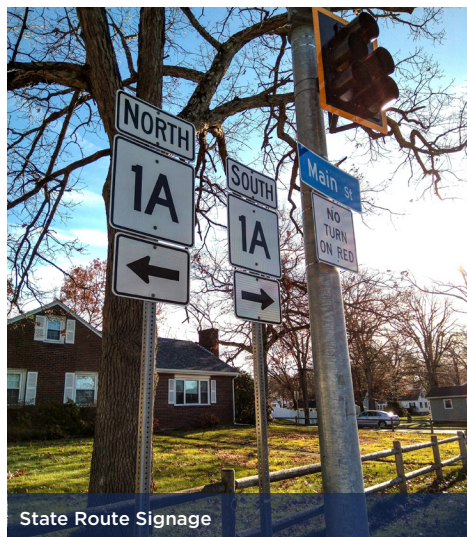
State Route Signage