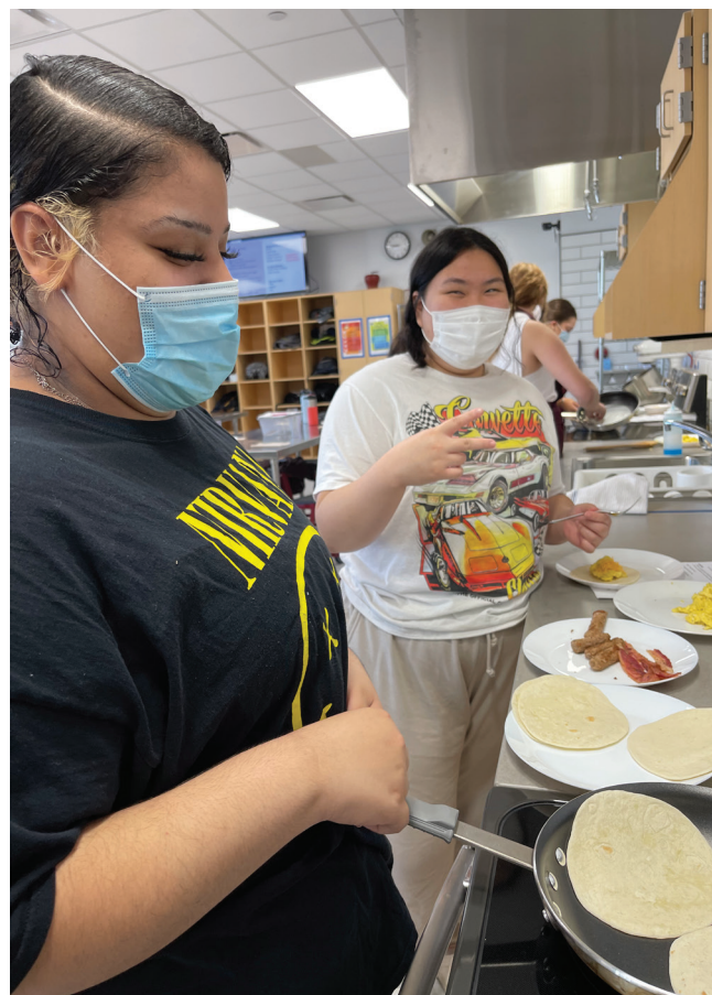
Students at Roseville Area High School learn how to cook in one of the new classrooms. Classes like this are part of the high school's Career Pathways program