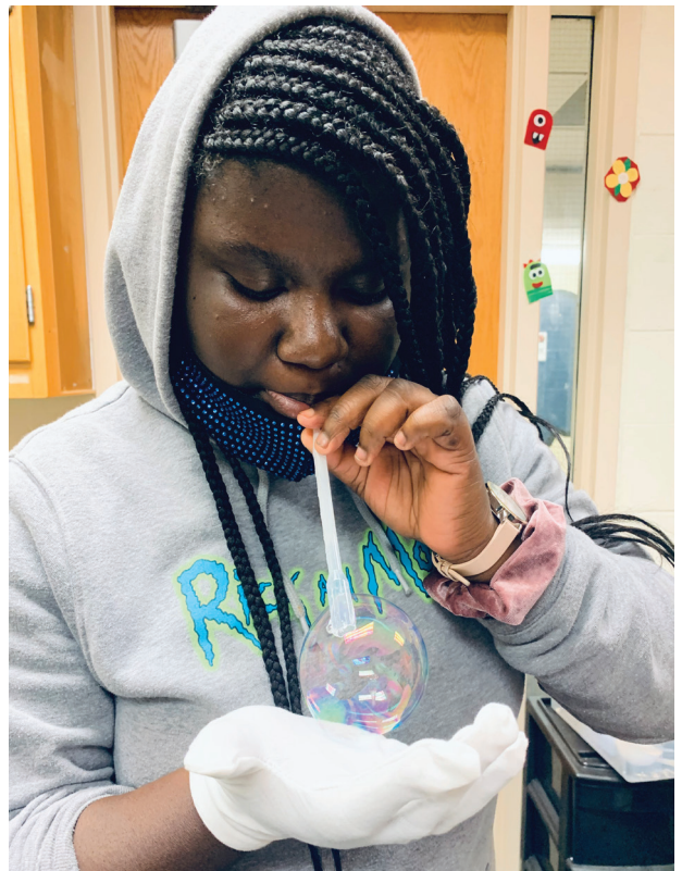
Learning about Unpoppable Bubbles was one of the STEM-in-a-Box activities.