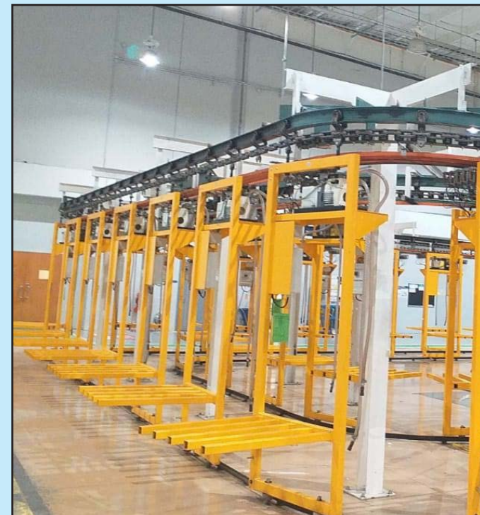
LOCCIONI VACUUM TES LINE 43 STATIONS