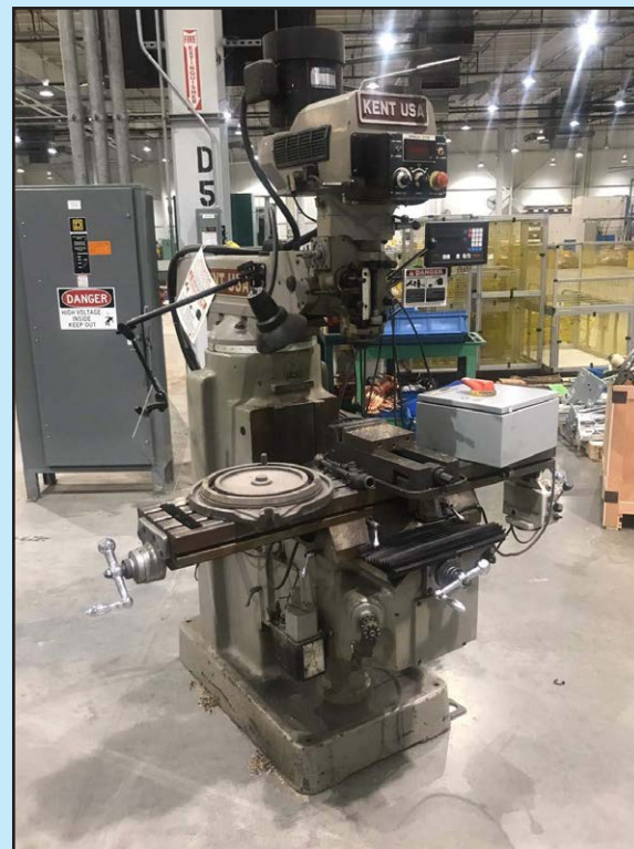
KENT VERTICAL MILLING MACHINE