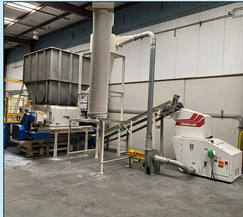
2007 VECOPLAN 60 HP MILL-M# RG 5260 SWU SHORT