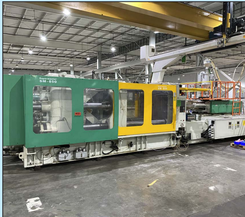
(1 OF 4) 2007 SUPERMASTER SM-450 TO SM-850 INJECTION MOLDING MACHINE(S)