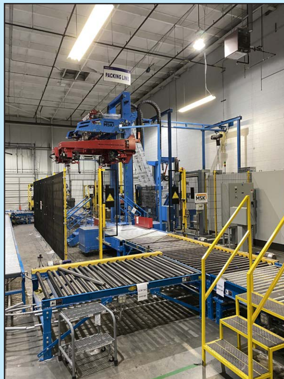
2016 MSK TENSIONTECH CLEARVIEW PACKAGING SYSTEM