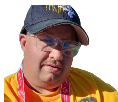
Sioux Falls Fireworks