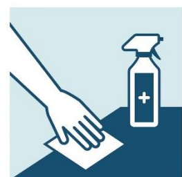
Keep objects and surfaces clean

Call your doctor again if you are getting worse. Call back if you are having trouble breathing. Do what your doctor says.