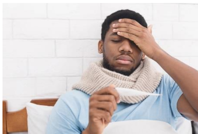
A fever of 100.4° or higher