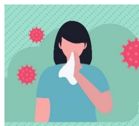
Use tissues, then throw them away