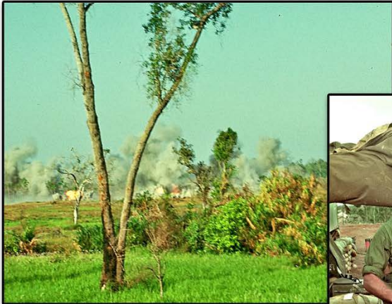
155MM ARTILLERY FIRE ALONG A WOOD LINE