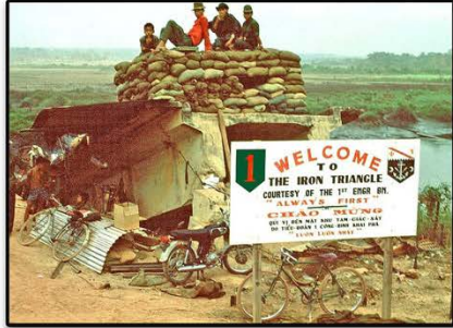
US ARMY 1ST INFANTRY DIVISION WELCOME TO THE IRON TRIANGLE