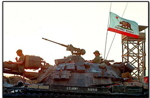
CHILLING AT THE BIEN HOA AIRFIELD JUST AFTER THE 1968 TET OFFENSIVE