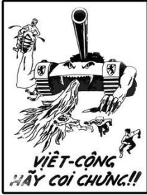
VIET CONG BEWARE