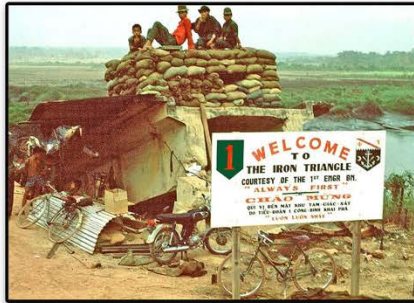
US ARMY 1ST INFANTRY DIVISION WELCOME TO THE IRON TRIANGLE