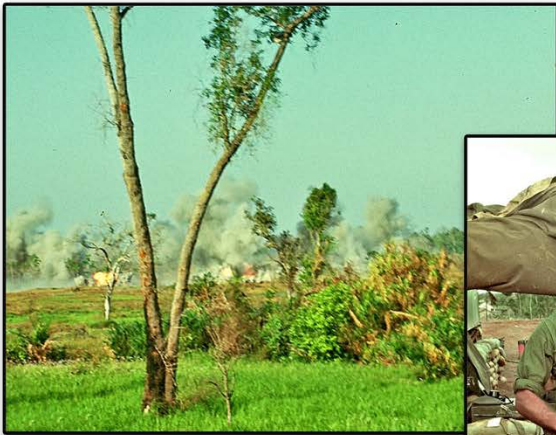
155MM ARTILLERY FIRE ALONG A WOOD LINE