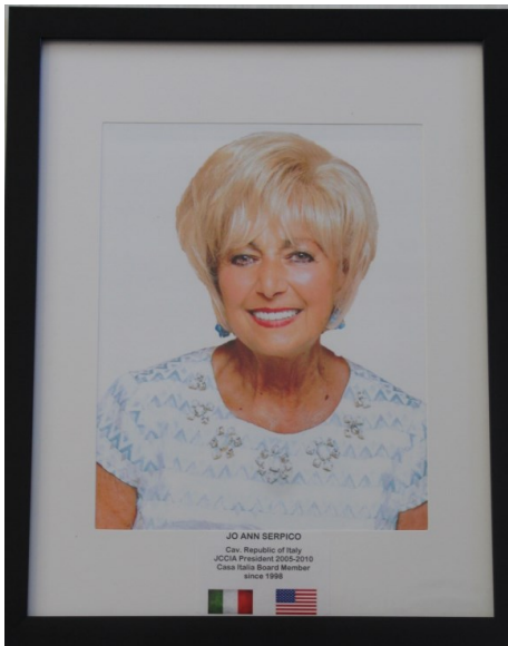
SAMPLE OF PORTRAIT FOR DISPLAY 11 x14 Black Frame with White Mat Photo size: 8 x 10 Color or Black & White

CASA ITALIA 3800 West Division Street Stone Park, IL 60165