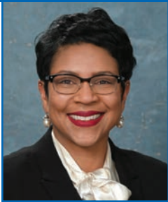
Sylvia Santana Senator Democrat Detroit