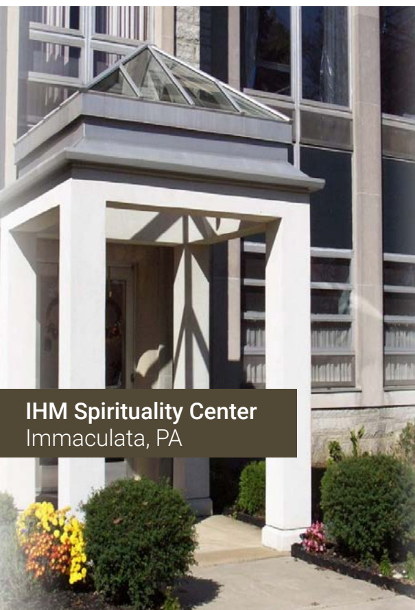
IHM Spirituality Center Immaculata, PA