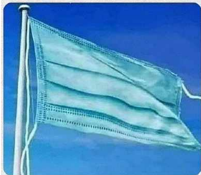
The Official flag of 2020

Though limited in scope, our enthusiasm remains high, and we all look forward to a more normal iteration of the Hospitality Committee.