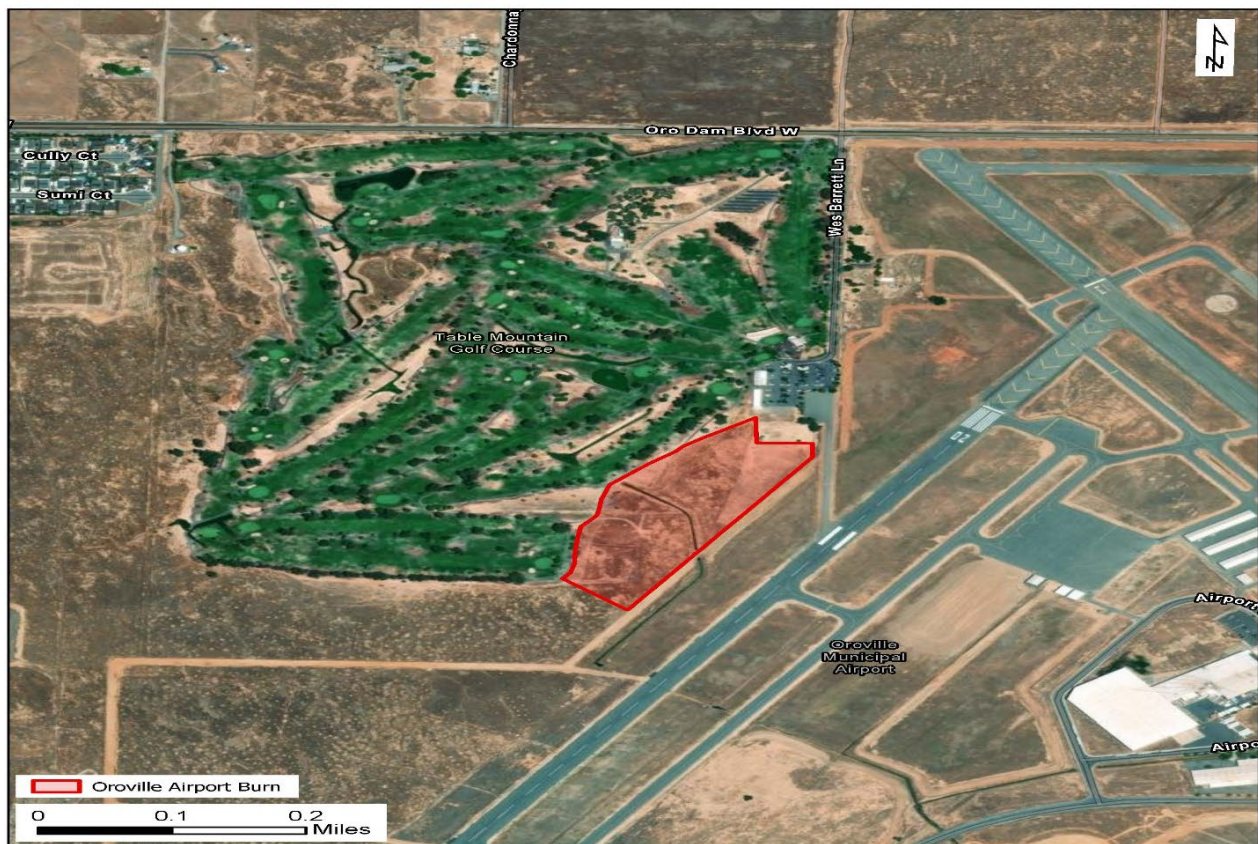
Oroville Airport Burn Vicinity