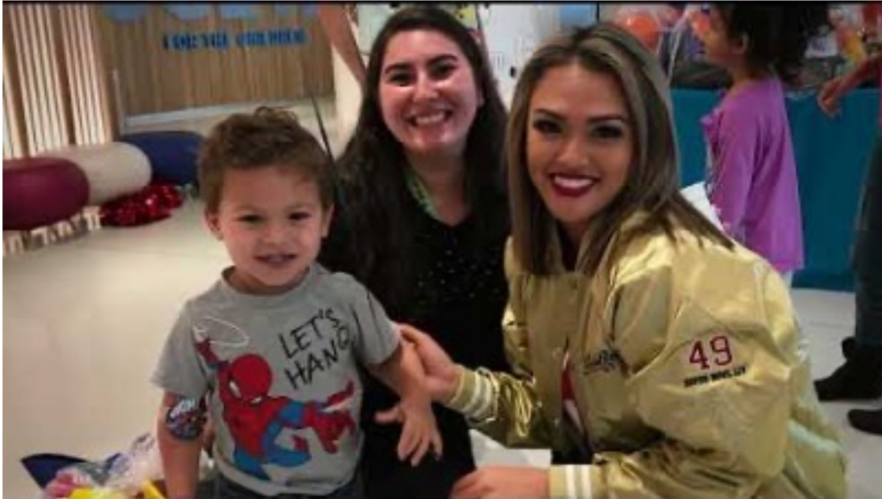
Basket of Hope Overview