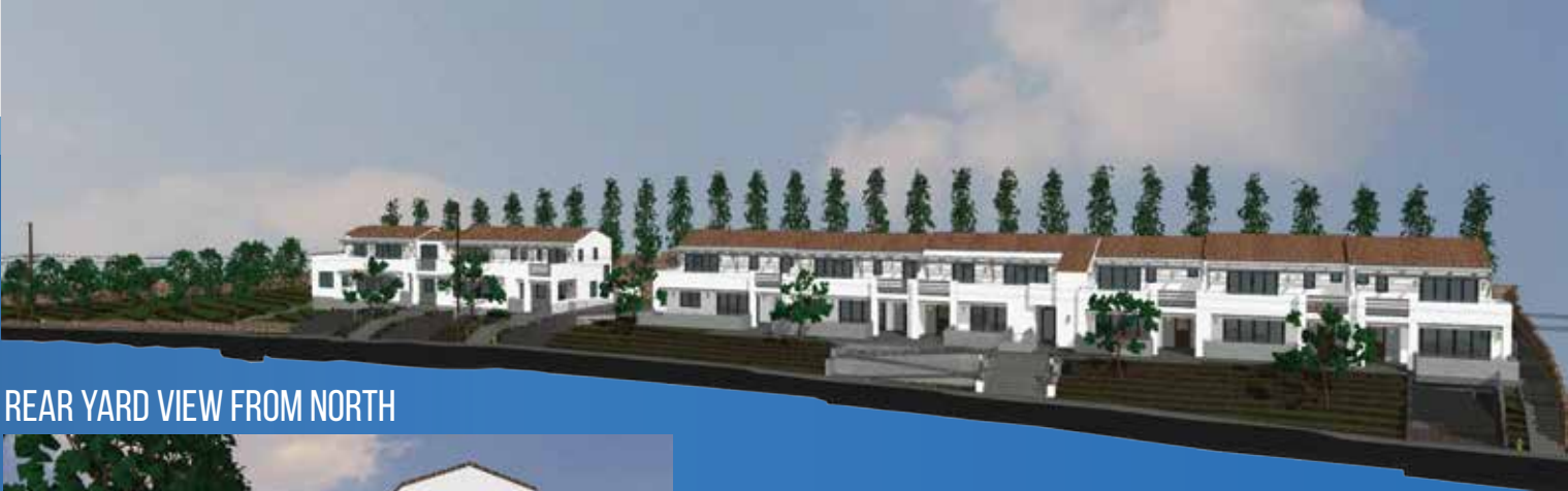
REAR YARD VIEW FROM NORTH