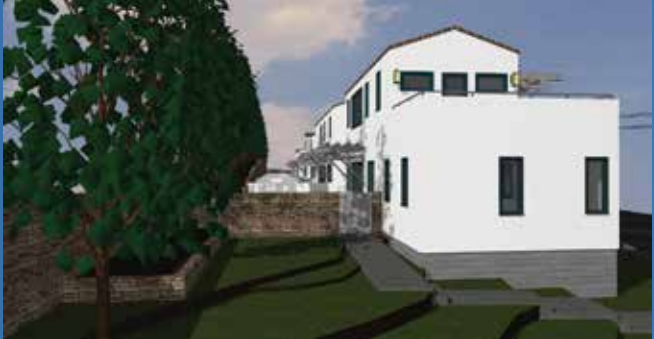
STREET VIEW FROM SOUTH