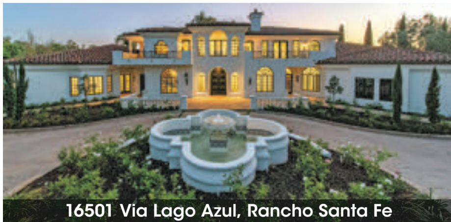
16501 Via Lago Azul, Rancho Santa Fe (Represented Seller)

A hidden gem of a townhome, walking distance to the village and everything Rancho Santa Fe has to offer.