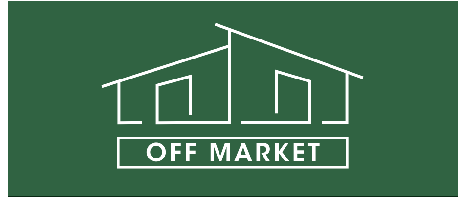
6163 Paseo Delicias, Rancho Santa Fe (Represented Buyer, off market)

A beautiful one story ranch home in the heart of Rancho Santa Fe