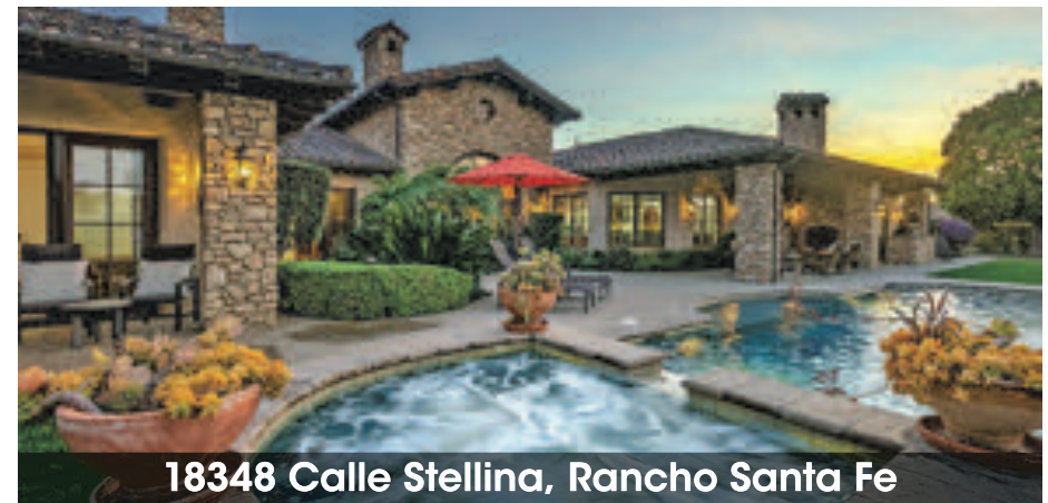
18348 Calle Stellina, Rancho Santa Fe (Represented Buyer, off market)

Fairbanks Ranch at its finest. This beautiful 12,000 sq. ft. masterpiece was completely renovated from top to bottom with no expense spared to delight even the most discerning of buyers.