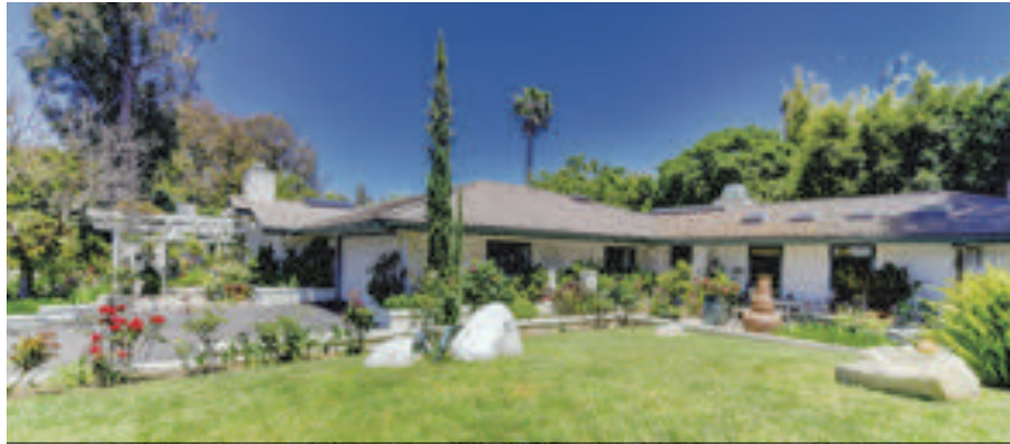
6026 La Granda, Rancho Santa Fe (Represented Buyer and Seller)

A beautiful one story ranch home in the heart of Rancho Santa Fe