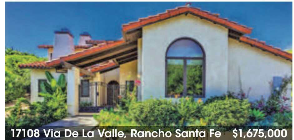
17108 Via De La Valle, Rancho Santa Fe $1,675,000

Contemporary home in iconic waterfront Cardiff by the Sea Community. Over 3,600 sq. ft. of the finest quality construction you will find. Located just blocks to the ocean, downtown Cardiff, SeaSide Market and Glen Park. This is the most desirable location in all of Cardiff. Ocean views and spectacular sunsets await. Plenty of room for a hot tub in the back yard.