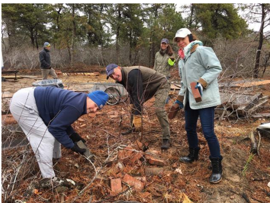
Volunteers from First Congregational Church of Nantucket, MA participated in a Habitat for Humanity project on April 23.