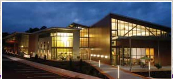
Piedmont College Commons

For those that will arrive by 5:00pm on Friday, June 23, please mark your registration form to note that you will join fellow attendees for dinner in downtown Clarkesville. Piedmont College will provide shuttle service to leave at 5:30pm. If time does not allow for you to join the group for this offsite dinner, a Starbucks café is located on the campus. For those staying at the Hampton Inn, there are a few dining options near the hotel.