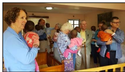
Group Holding Babies

There are 52 babies under two years old at the Nairobi site. Lots of volunteers are needed to care for these children. All the children want is to be held and loved. As soon as you walk into the room, their arms are raised up to be held. Also at the Nairobi site, they are building a clinic so the children can be close to health care. This clinic will be open to the public.