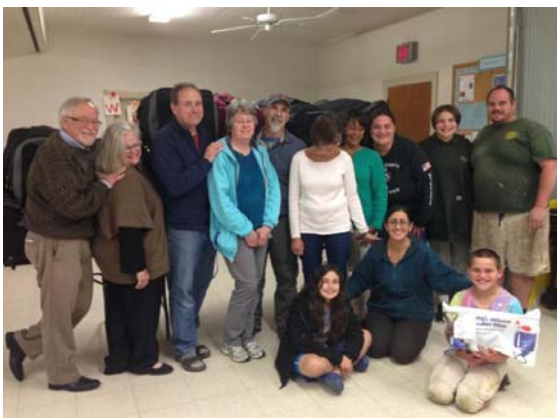
The team of volunteers who assisted in packing up the water purifiers which were later sent to families in Puerto Rico.